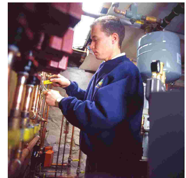
To reduce heat flow to unused rooms, valves on some hot-water radiators may be turned down. Valves on steam radiators should always be completely on or off.