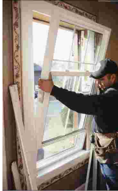
Low-E Windows help keep heat inside during winter, outside in the summer *

Your doors are another direct link to the outside air. While there are numerous materials that are used to construct doors today, the crucial property is the insulating value or R-value, the resistance to heat flow. Your doors should have an R-value of 4.0 or higher to be an effective barrier to heat gain and loss.