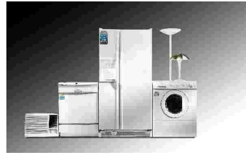
You'll find the ENERGY STAR on brand name appliances and lighting