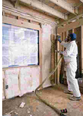
Foam Insulation *

Wall insulation also helps resist heat flow and help maintain the comfort level in your home. If your home does not have wall insulation, you should consider upgrading it to achieve a heat flow resistance value of R-13. Please contact the Gas Company at (888) 431-2226 to learn more about their incentives and program requirements.