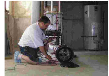
A properly installed and tested duct system maximizes your heating/cooling system efficiency.