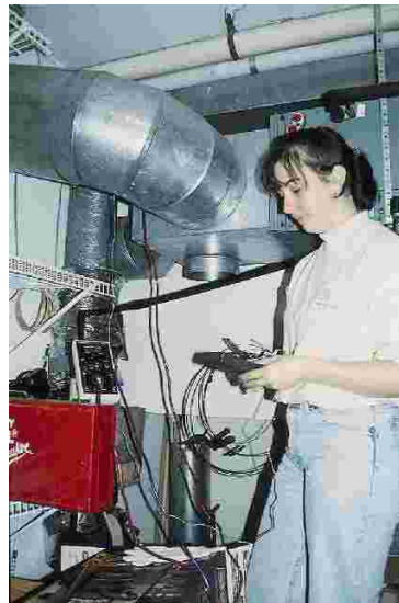
Computerized Air Flow Testing