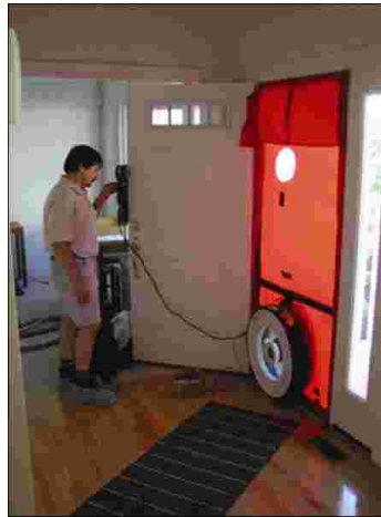
Blower Door Test

A variety of materials may be used to seal air leaks, depending on their size and location. A combination of sealant foams, rigid baffles, caulking, weatherstripping and rigid insulation may be utilized to effectively seal air leaks in your home. This procedure also helps prevent moisture problems, peeling paint and structural damage in walls and building cavities. Air sealing should accompany most attic insulation activity. Your air sealing recommendations are indicated at right.