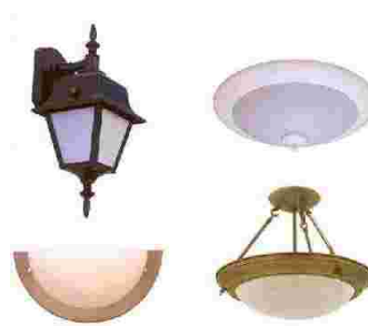
ENERGY STAR qualified lighting uses 75% less energy and lasts 10 times longer than conventional incandescent lighting.