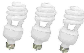
ENERGY STAR qualified compact fluorescent light bulbs provide the same quality color and light output as conventional bulbs.