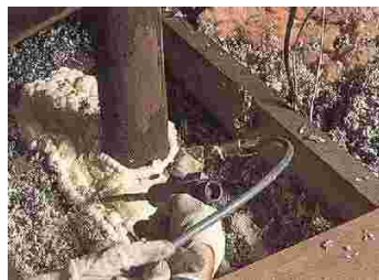
Sealing Air Leaks around Plumbing Chases