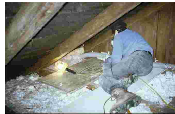
Cellulose Insulation *