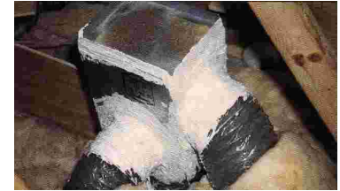
Contractors use a special mastic & fiberglass perma-sealant to guard against air leaks in the duct system.

In addition, your air ducts must be adequately insulated. All ducting that is in contact with outside air should be insulated to meet Title 24 efficiency standards. The insulation should also be secured with approved, mechanical fasteners to ensure that all seams are properly sealed and will be maintained for the life of the system. Needless to say, poorly sealed and insulated air ducts will lead to reduced comfort, increased operation of your heating and cooling system, and increased utility bills.