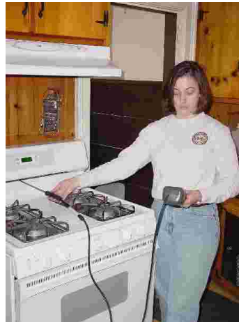
Combustion Safety testing on a gas stove.

Combustion safety is an important component of all gas using appliances. All of your gas using appliances must operate within the prescribed safety ranges established by the Environmental Protection Agency. Incomplete combustion by these appliances can lead to increased carbon monoxide (CO) levels. In addition to testing the CO levels, the draft in the flues must be tested to make sure the heating/cooling system and other fans in the house cannot back draft the gas appliances, causing health issues for the occupants. All of your appliances were tested for their CO levels as well as the draft in the flues. The results of your appliances and their associated CO readings are included in the attached Combustion Safety Table.